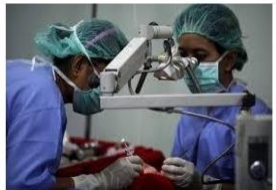
Private hospitals are generally equipped with modern medical equipments

Private health services refer to those services which are offered by privately owned clinics or hospitals. These are either owned by an individual or by an organisation. Private hospitals are generally equipped with modern medical equipments and laboratories. Usually, many facilities such as ultrasound, X-ray etc. are located within the premises of these hospitals.