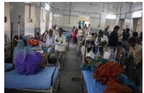
Public health care is so called as in public hospitals the cost of treatment and medicines are low. Most of the financial resources come from the taxes paid by the people.