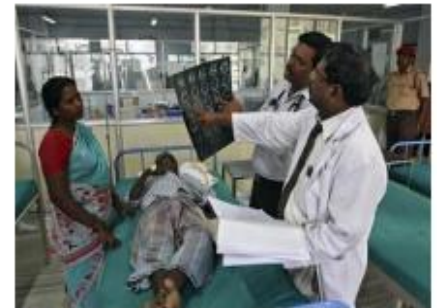
The chains of hospitals and health care centres in India which are run by the government are known as public health services

Public health services are so named because of the following reasons: