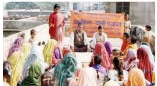
The State Governments, by allocating money to the panchayats, can improve the general health standard of the people in the villages