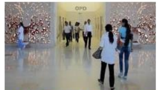
In the private hospitals, the cost of treatment is so high that common people are hardly afford them